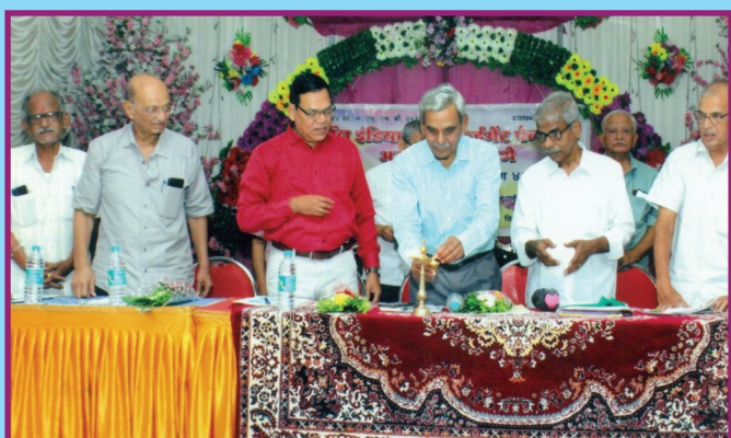
Lightening the lamp to inaugurate the AGM, Sindhudurg held at Kankavali on 12.04.2022