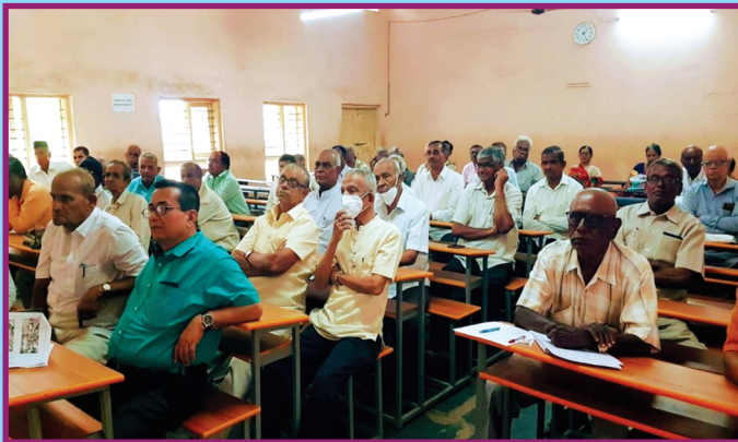
View of Audience at AGM, Dharwad held on 19.06.2022