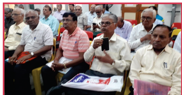
View of Audience at EOGBM held at Pune on 23.05.2022