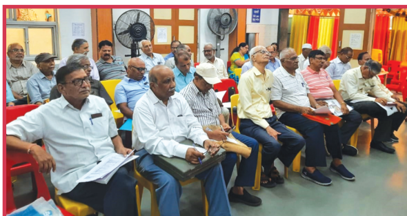
View of Audience at EOGBM held at Pune on 23.05.2022