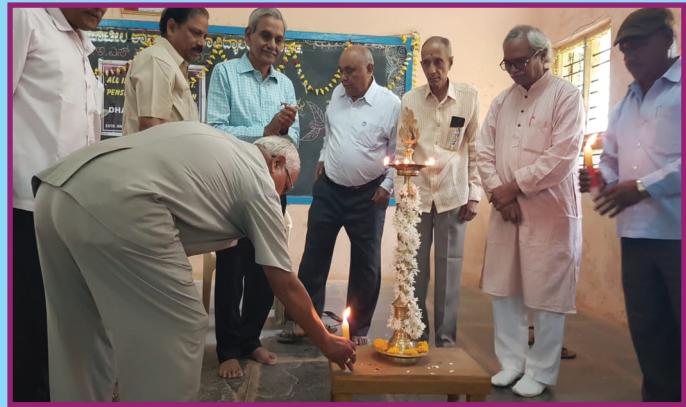
Lightening the lamp by dignitaries at AGM, Dharwad held on 19.06.2022