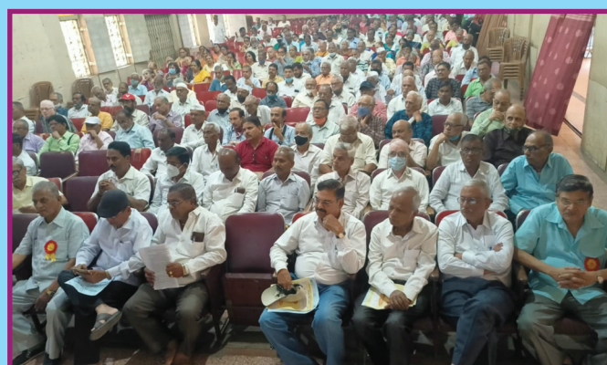
View of Audience at AGM, Pune held on 15.06.2022